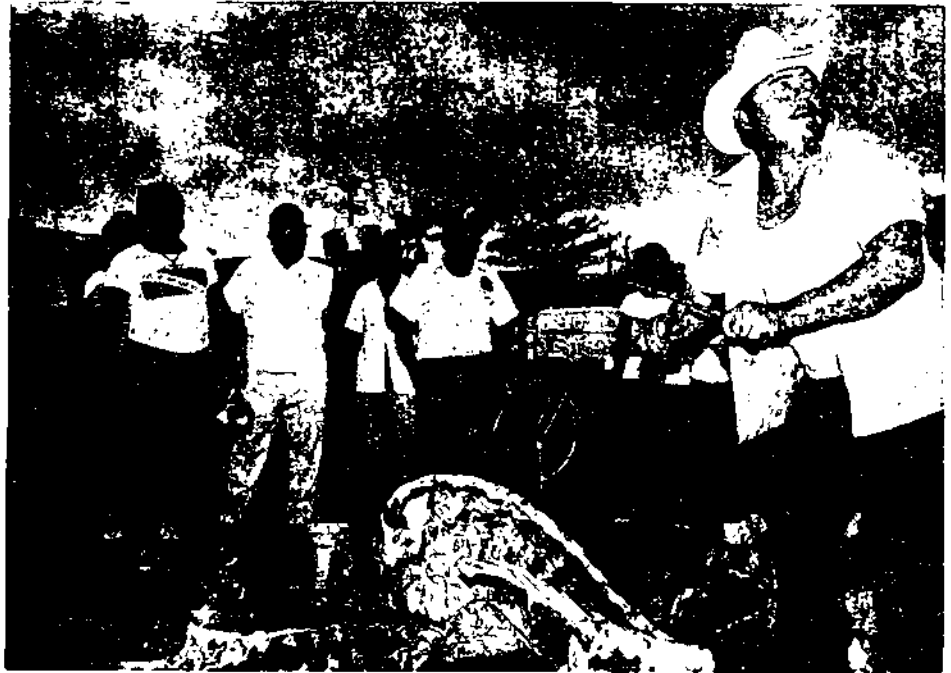
Butchered bull in Isla Mujeres, Mexico